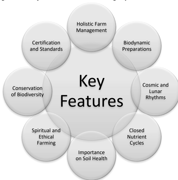
Figure 2: Key Features of Biodynamics of Agriculture

The principles of ecology, ethics, and spirituality are integrated in biodynamic agriculture. Cosmology is an essential component of this method, with its ideas about the unity of soil, plants, animals, and rhythms. Biodynamic farming is practiced with specific preparations and consideration of cosmic forces, differing from organic farming despite being related. Biodynamic agriculture is practiced with the following key features shown in figure 2.