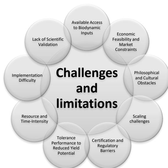
Figure 3: Challenges and limitations of biodynamic agriculture

The challenges and limitations to the adoption and efficacy of biodynamic agriculture, which is an ecologically and spiritually integrated farming system, are afflicting it. These issues include the lack of scientific validations of the theory and the difficulty in accessing the market are shown in figure 3.