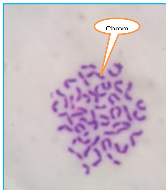
Figure 2 : Chromosomes in metaphase of a bone marrow cell in a mouse treated with 0.2% Gasoline (positive control group) .